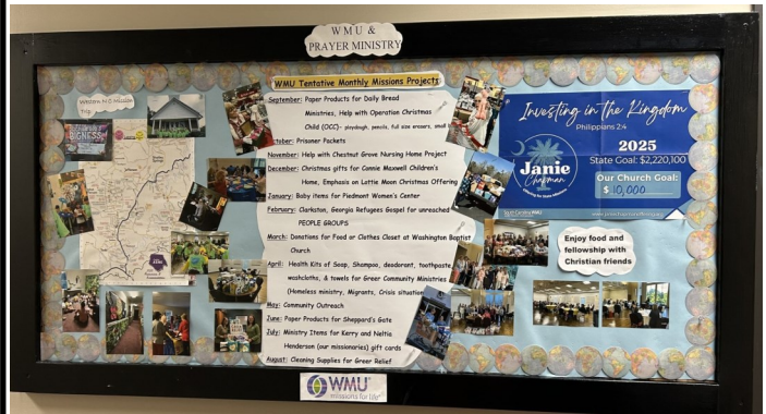
Servants of Christ, The WMU Ministry Team

----- We are starting a new church year and this is a great time for you to join WMU! We meet the first Tuesday of every month in the fellowship hall from 6:30-8:00 pm. WMU is where we praise God, practice prayer, and participate in hands on missions!